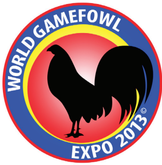
EXHIBIT SPACE & ADVERTISEMENT CONTRACT

FAX to (632) 855.8346 or E-MAIL to wgfe@worlddexco.com